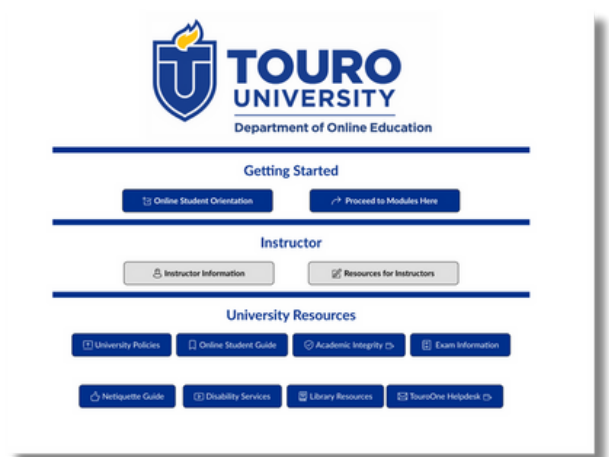
The Touro Course Home Page in Canvas